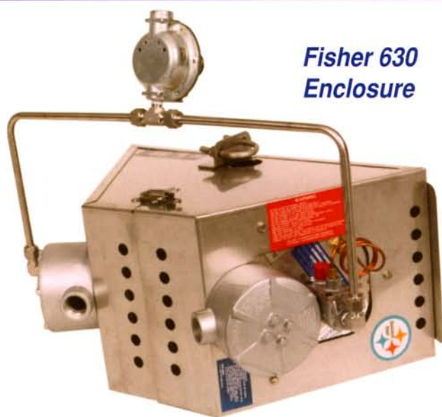
Fisher 630 Enclosure